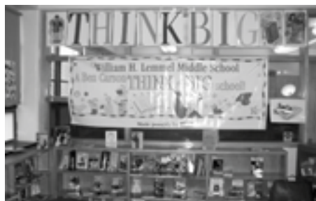
William H. Lemmel Middle School

Reading Room total by the end of the school year will be 27!