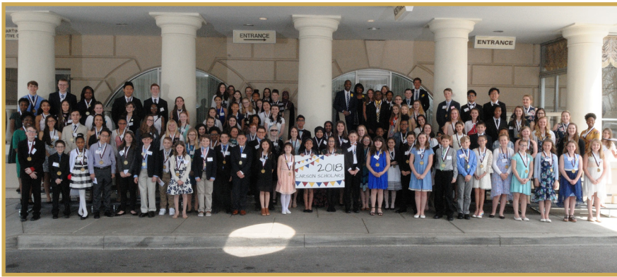
Martin's West | Baltimore, MD April 22, 2018