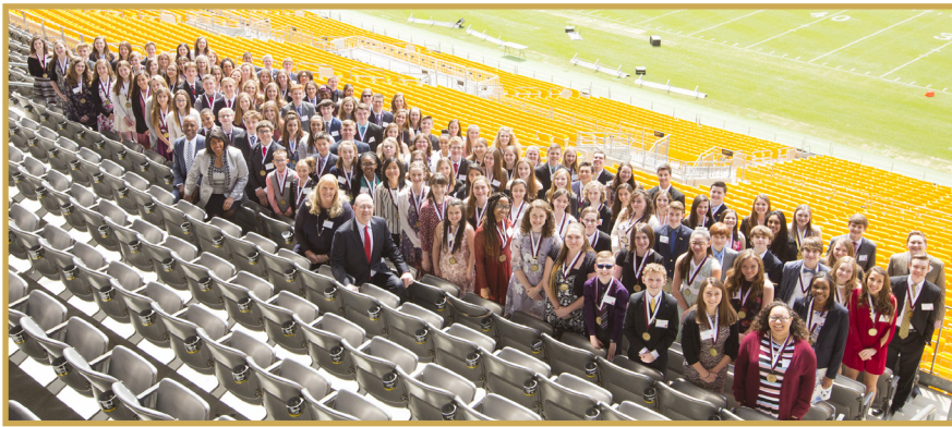
Heinz Field | Pittsburgh, PA April 7, 2018