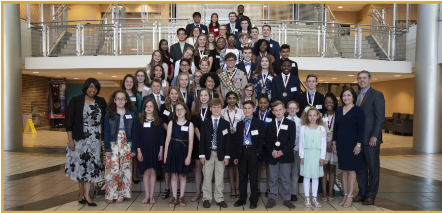
University of Tennessee at Chattanooga | Chattanooga, TN April 29, 2018