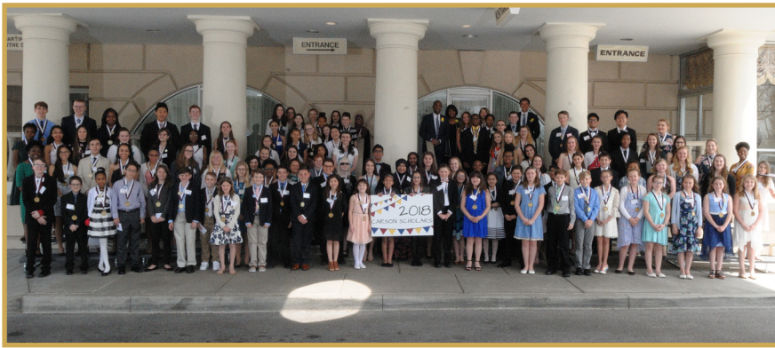
Martin's West | Baltimore, MD April 22, 2018