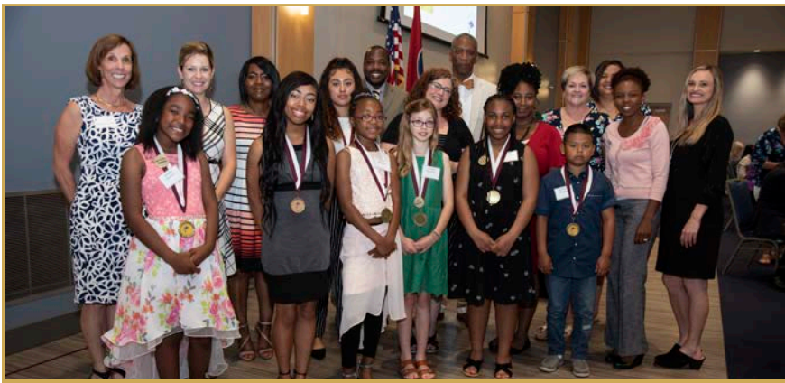
Virtual Banquet May 9, 2020