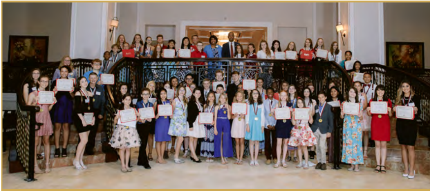
2020 CSF Virtual Banquet May 9, 2020