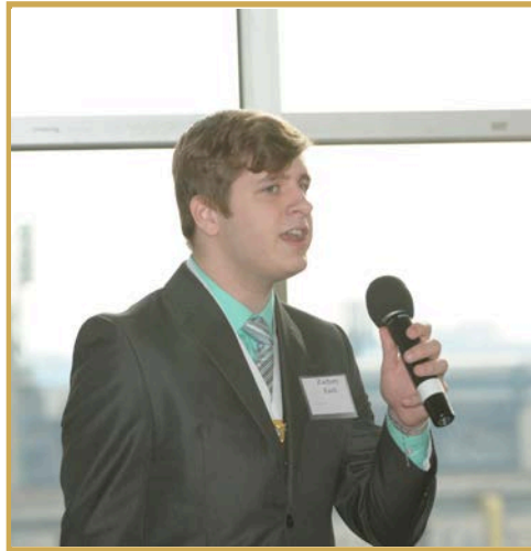
Virtual Banquet May 9, 2020