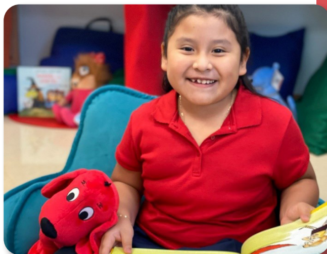
Reading Rooms Opened Per Year