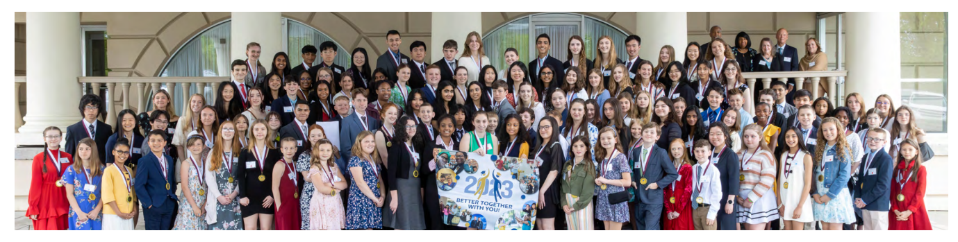
Read below for some of our favorite moments from each banquet.

The theme for this banquet season was "Better Together." We recognize that when educators, mentors, donors, volunteers, families and Carson Scholars join forces, the possibilities are limitless. This sentiment proves true time and time again as we watch the CSF community rally together and thrive amidst difficult circumstances!